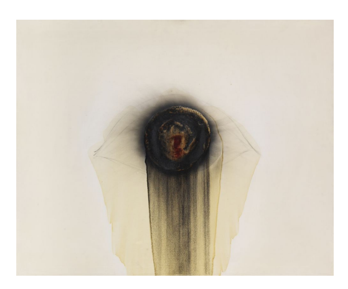
Otto Piene Auge Oil, fire, smoke on canvas, 1965 80 x 100 cm / 31.4 x 39.3 inches Estimate: € 80,000 -120,000

Next to Heinz Mack 's "Lichtfächer" (estimate: € 120,000-150,000) and Otto Piene 's "Auge" (estimate: € 80,000-120,000) in the section of Post War Art, as well as Adrian Ghenie 's self-portrait (estimate: € 50,000-70,000) from the department of Contemporary Art, fascinating artists ljke Willi Baumeister , Gotthard Graubner , Konrad Klapheck , Paul Klee , Walter Leistikow , Max Liebermann ,