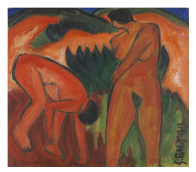
Karl Schmidt-Rottluff Rote Düne, 1913 Oil on canvas, 65 x 74,5 cm Estimate: € 800,000 – 1,200,000

Other major Kirchner works in the collection are, along with the "Hockende" (estimate: \notin 700,000-900,000), one of the few preserved sculptures by the artist and an absolute rarity on the international art market, the painting "Fehmarnküste mit Leuchtturm" from 1913 (estimate: \notin 700,000-900,000) and the 1910 oil painting "Im Wald" (estimate: \notin 600,000-800,000). While the first is a document from the important creative period in Berlin, the latter is a prime example of the accomplished "Brücke" style, a highlight from the artist group's important time at the Moritzburg Ponds.