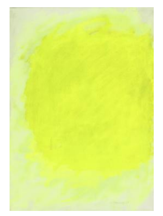
Arnulf Rainer Gelbe Übermalung,1958 Oil on canvas, 70 x 50 cm