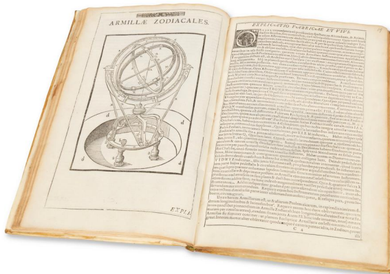
Tycho Brahe, Lot 8

The first publication of Hans Bellmer's surrealist photographs "La Poupée" from 1949 (lot 77, estimate price: € 45,000), George Grosz's first large portfolio "Ecce Homo" (lot 63, estimate price: € 30,000) and the portfolio "Arno Holz zum sechzigsten Geburtstag", which was dedicated to the poet and playwright by painters, draftsmen and lithographers who were friends with him (lot 62, estimate price: € 18,000), are also noteworthy.