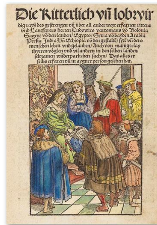
Ludovico de Varthema: Rare first German edition. Lot 9