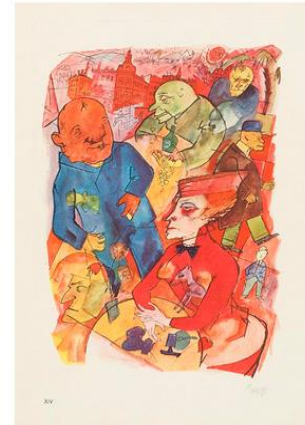
George Grosz, Lot 63

Francisco de Goya y Lucientes (1746-1828) created "La Tauromaquia" between 1814 and 1816, a series of 33 etchings in drypoint and aquatint illustrating the history of bullfighting. After the first publication in 1816, the plates disappeared and were only used for the second edition in 1855, which is now on offer at Ketterer Rare Books. (Lot 48, estimate price: € 25,000)