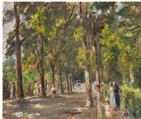
Max Liebermann Große Seestraße in Wannsee, around 1925. Sold for: 1,742,000 €