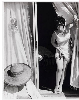
Cindy Sherman Untitled Film Still #7, 1978 Sold for: 330,200 €