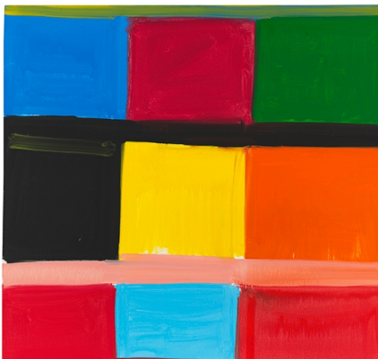
Stanley Whitney Stay Song #54, 2019 Sold for: 254,000 €