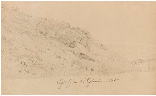
Caspar David Friedrich Wiese in Teplitz, 1835 Sold for: 63,500 €