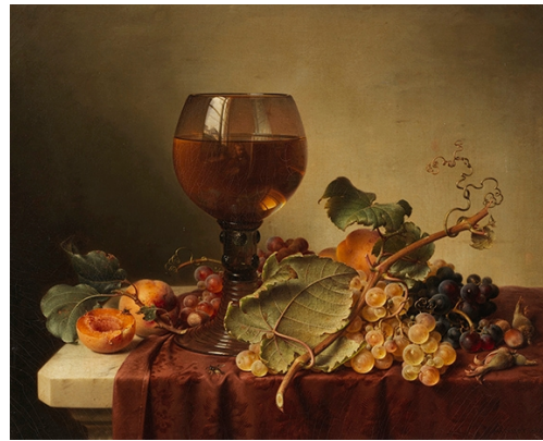
Stilleben mit Selbstportrait im Weinglas und Früchten, 1861. Sold for: 111,125 €