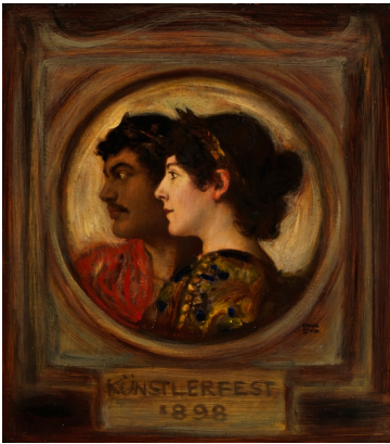
Franz von Stuck Franz Mary von Stuck - Künstlerfest, 1898 Sold for: 139,700 €