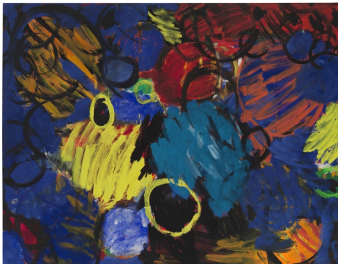
Ernst Wilhelm Nay Motion, 1962 Sold for: 1,621,000 €