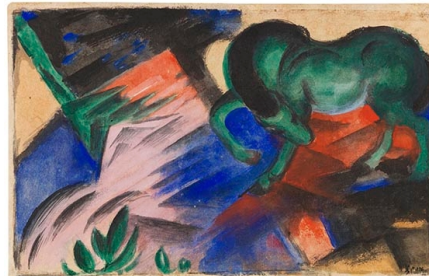
Franz Marc Grünes Pferd, 1912 Sold for: 2,468,000 €